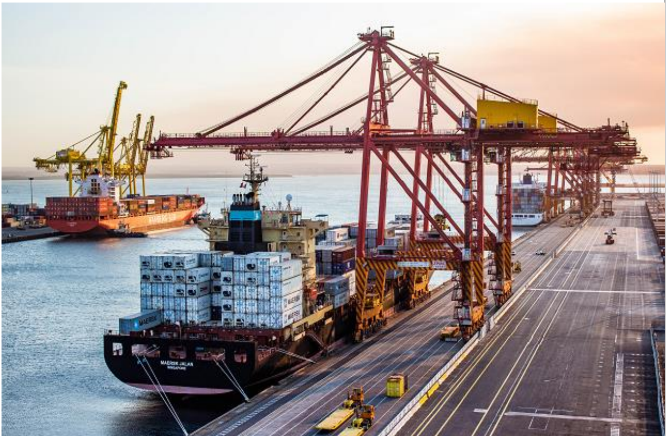
Maersk Jalan berthed at Patrick Port Botany Terminal( 2016

Reporting Period: 1 January to 31 December 2023