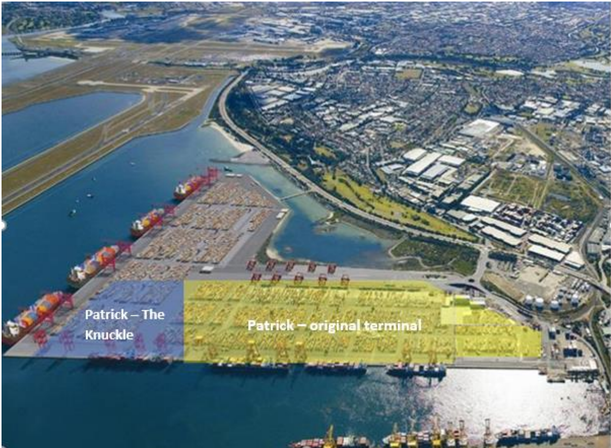
Figure 2.12: Layout of Patrick’s Sydney Autostrad Terminal (Port Botany)

In April 2015, the terminal replaced its manual straddle fleet with automated straddles (Autostrad) operating within a fenced automated yard.