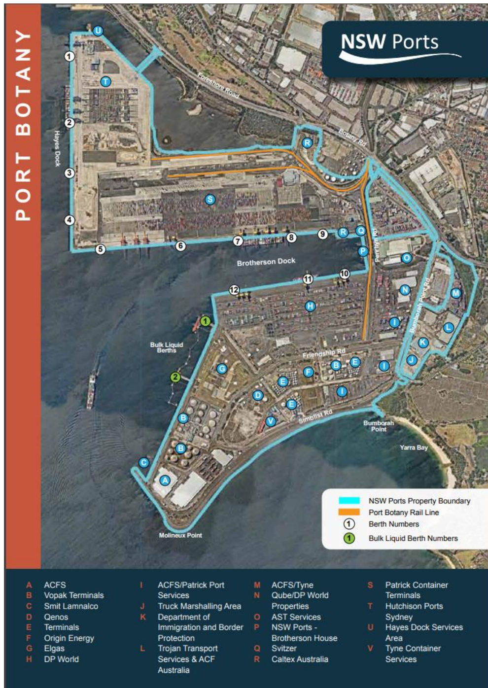
Figure 2.1.1: Location of Patrick's Sydney Autostrad Terminal at Port Botany

The Patrick Sydney Autostrad Terminal (SAT) is located at Penrhyn Road (Inter Modal Access Road), in the suburb of Banksmeadow (NSW 2019) which borders the boundary with the suburb of Port Botany (NSW 2036). Foreshore Road and Botany Road are located to the north and Brotherson Dock to the south. Figure 2.1.1 below provides an overview of the site context which is comprised of approximately 63 hectares of land.